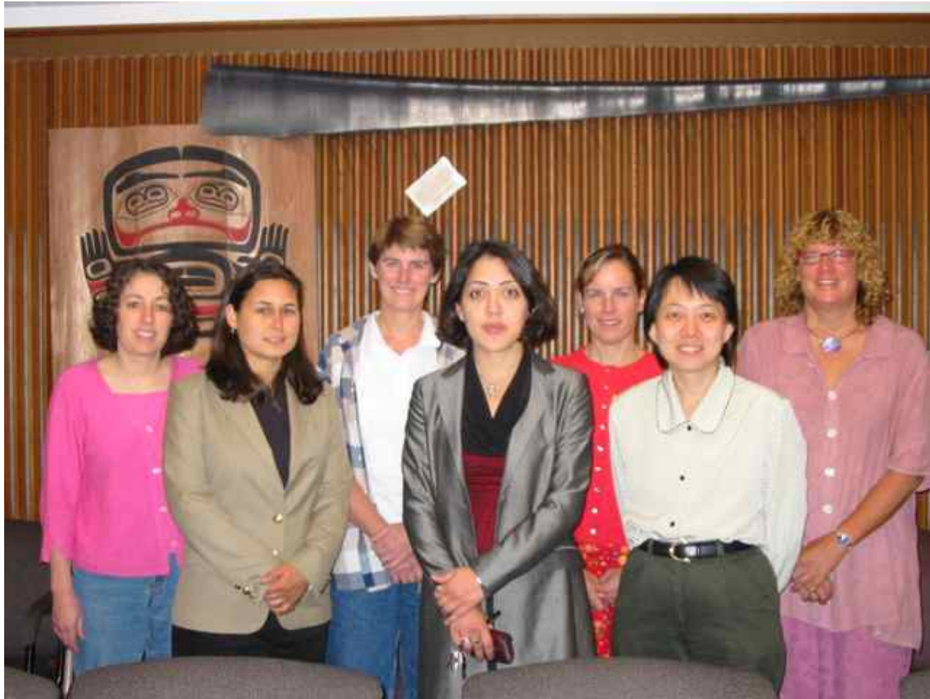
7 of the 9 Women in the 2002 UW EE Department